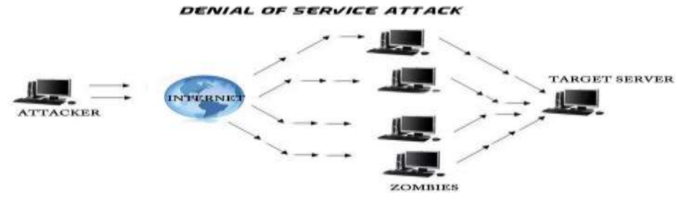
Fig. 2: using of Zombies in DoS attack

The security is a very big concern to deploy cloud services over Internet. Because of the distributednature of the Internet, the confidentiality, integrity and availability must be taken seriously.One of the top security problems is the Denial of Service (DoS) and distributed denial of service(DDoS) attacks [6]. It affects the availability of cloud services. In this attack, the attacker mustcompare and test many hosts, and select the weakest hosts known as zombie computers illustrated in Fig. 2 to usethem to start his attack [7]. The main objective of the DoS attack is to make services unavailable to itsusers by targeting web servers, CPU, storage, and the other network resources this objective finished by flooding target by superfluous packets to overload targeted system to make it unavailable[1].Distributed denial of service attack aims to overload targeted system by flooding it using many sources, that's make it very hard to stop the attack by block single IP source.The virtualizationand multi-tenant infrastructure used in cloud computing make it an easy target for attackers.Attacker can deploy his denial of service using different attack tools for example (Stacheldraht, LOIC,ReDoS)[1].